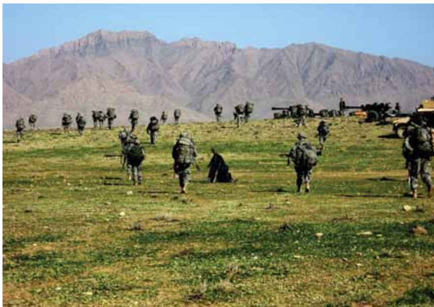
82d Airborne Division in Helmand Province, Afghanistan, as part of Operation ACHILLES

combat patrols, which resulted in almost one hundred fifty casualties by the beginning of December. (See Table 6.) On 15 January 2007, NATO leaders formally declared an end to the operation.