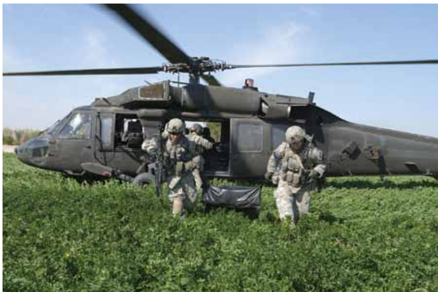
UH-60M Black Hawk helicopter

Logistics, also approved procurement of advanced materials in FY 2008 for the program to upgrade the U.S. military's popular Black Hawk helicopter. The Bush administration requested $1.2 billion for forty-two Black Hawk helicopters in FY 2007.