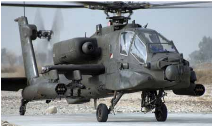
AH-64D Apache Longbow attack helicopter

would reduce FCS research and development allocations by $47 million, while also cutting funds for FCS manned, common, and unmanned ground vehicles.