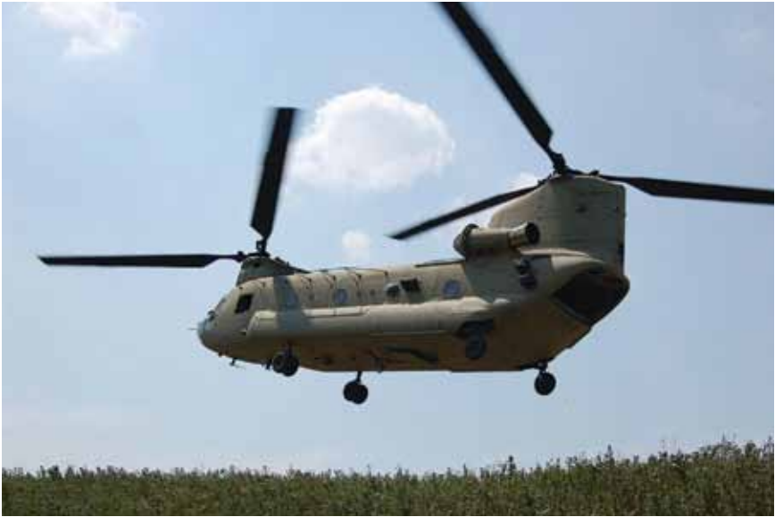
CH-47F Chinook helicopter