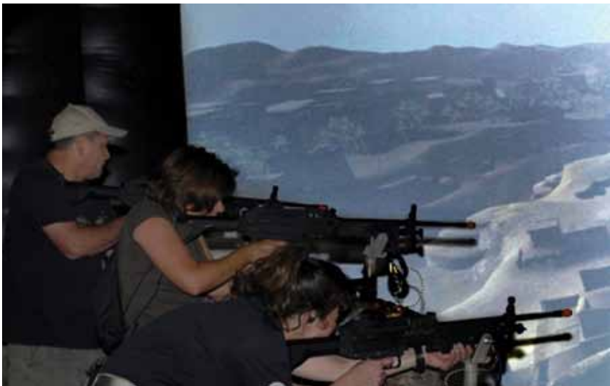
Participants take an interactive tour inside the Virtual Army Experience exhibit on the National Mall in Washington, D.C., 10 May 2007, as part of National Public Service Recognition Week.

goals, in part due to the use of deployed reenlistment bonuses to active duty soldiers in Iraq, Afghanistan, and Kuwait ( Table 4 ). These incentives included tax free lump sums of up to $15,000, with an average payment of $10,400, provided soldiers reenlisted for three- to six-year extensions while still in the war zone. The Army increased bonuses by as much as $7,500 for soldiers whose terms of service expired in FY 2007, if they reenlisted by 30 April.