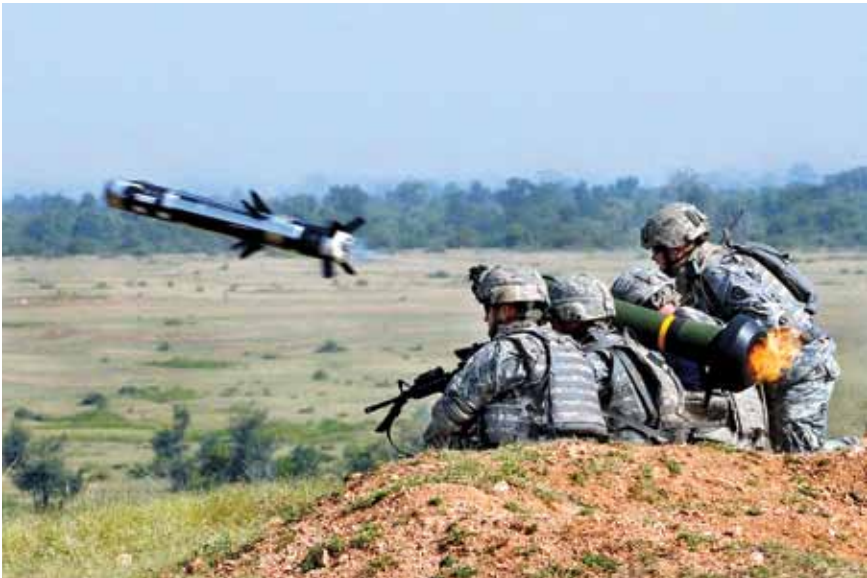
Javelin antitank missile system

Javelin antitank weapon, a tank upgrade program, Future Combat Systems, the interim armored vehicle, and several tactical vehicles.