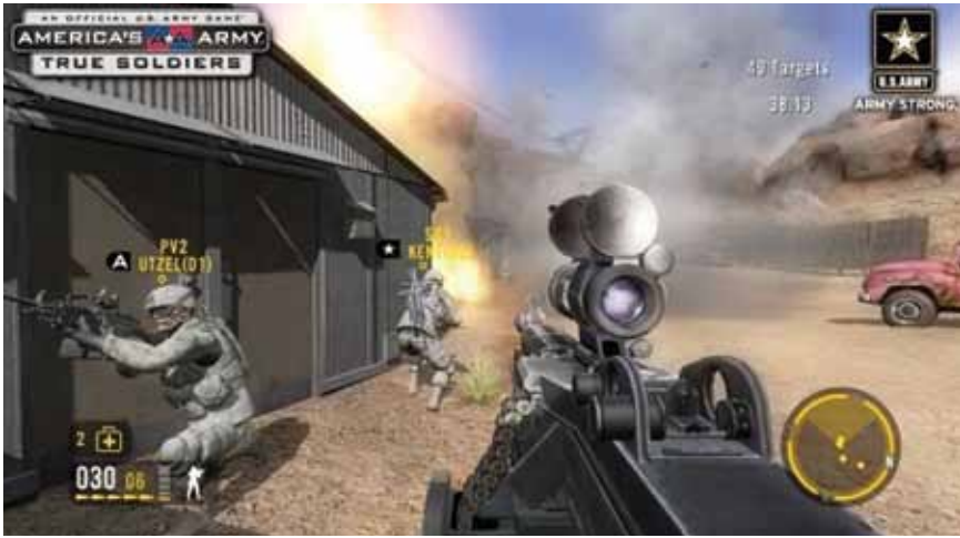
Originally released in 2002, “America’s Army” was created for recruitment purposes.

thousand former successful recruiters to augment the current recruiting force; and requesting general officer assistance to help the recruiting effort through speaking engagements in local communities and colleges and at events. Increasing the maximum enlistment age to forty-two years brought in hundreds more recruits that year as well.