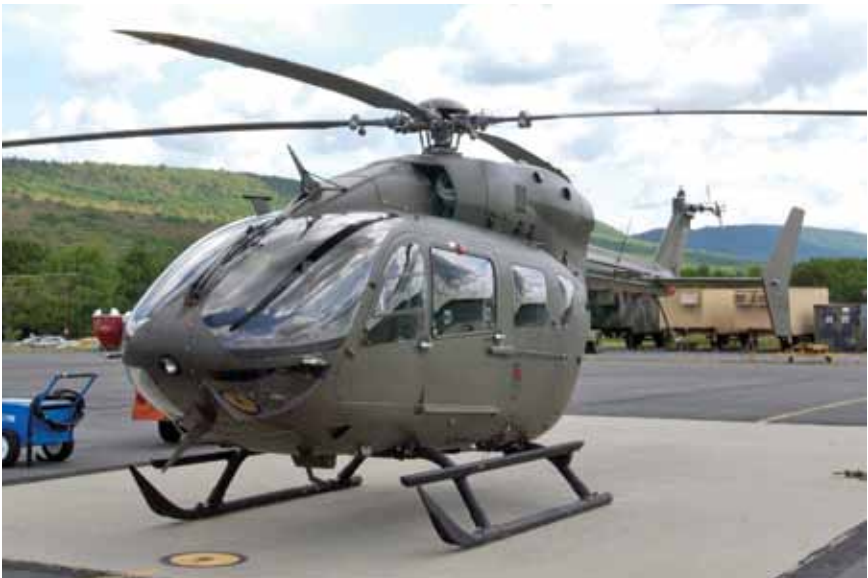
UH-72 Lakota helicopter