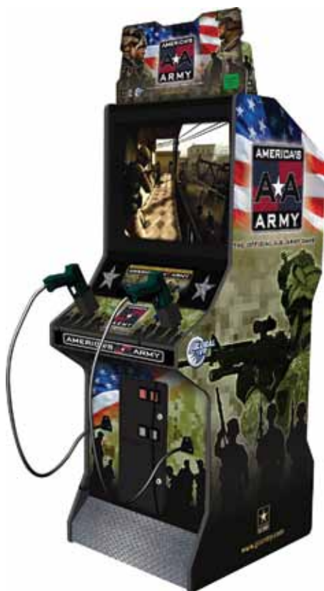
In 2007 “America’s Army” was released in several new platforms including arcade and mobile devices.

The Army Recruiting Command announced $20,000 “quick-ship” bonuses for aspiring recruits with no prior military service who enlisted for at least two years of active duty and reported to basic training within thirty days of their enlistment. Other initiatives included adding financial incentives and advertising a two-year enlistment option; establishing a program to help refine nearly one million leads to identify prospective recruits with the highest potential to enlist, to save recruiters time and allow them to focus on prospecting; requesting additional soldiers graduating from initial training to serve as hometown recruiter assistants and returning combat veterans to serve as special recruiter assistants; re-emphasizing the $2,000 referral bonus program; requesting the temporary return of up to one